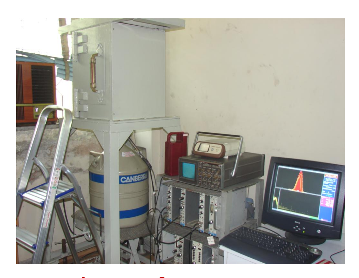
NAA Laboratory & HR Diffractometer