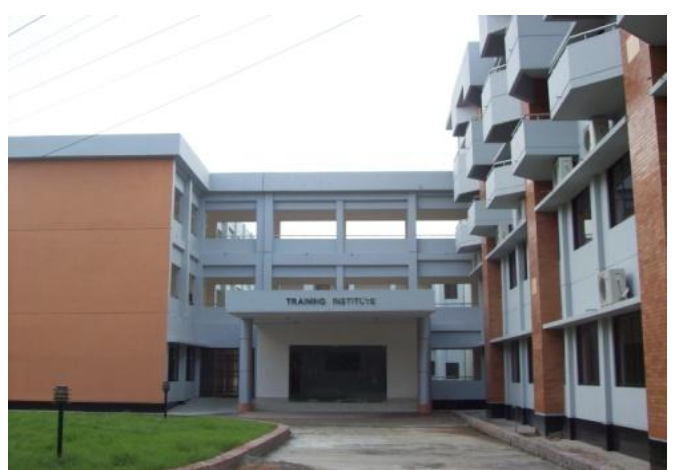
Views of the Existing Training Institute at AERE, Savar, Dhaka