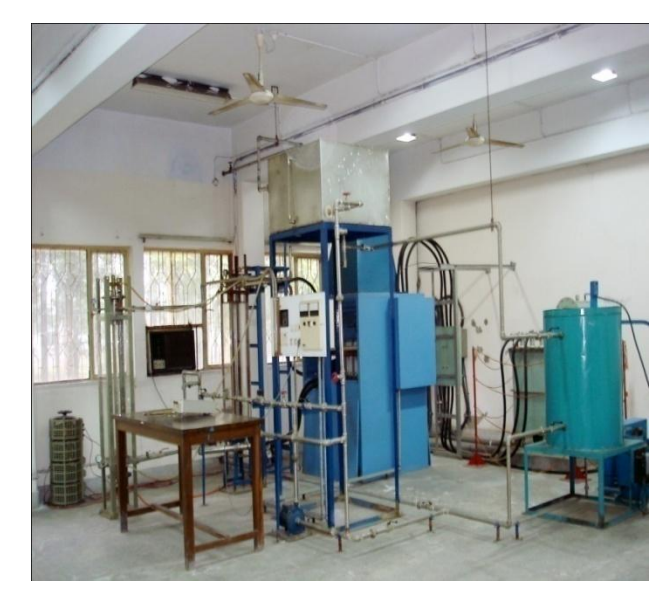
Heat Transfer Rig