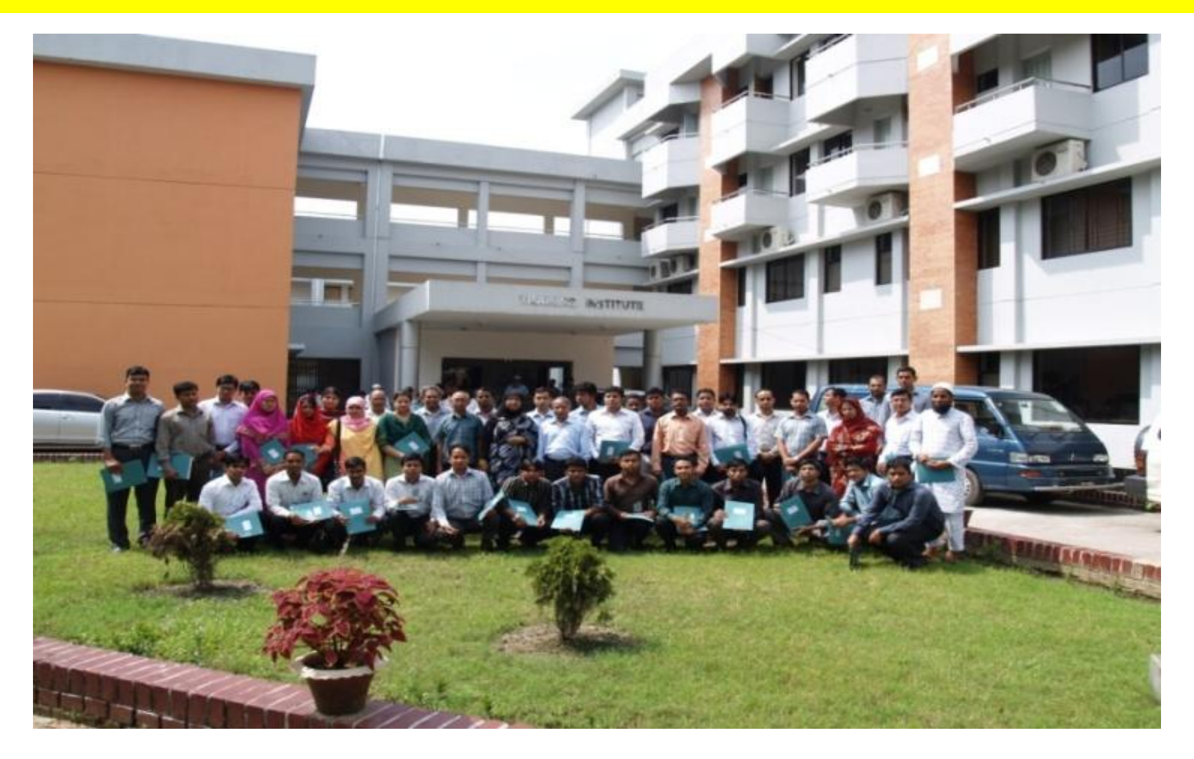
Training Institute, AERE, Savar