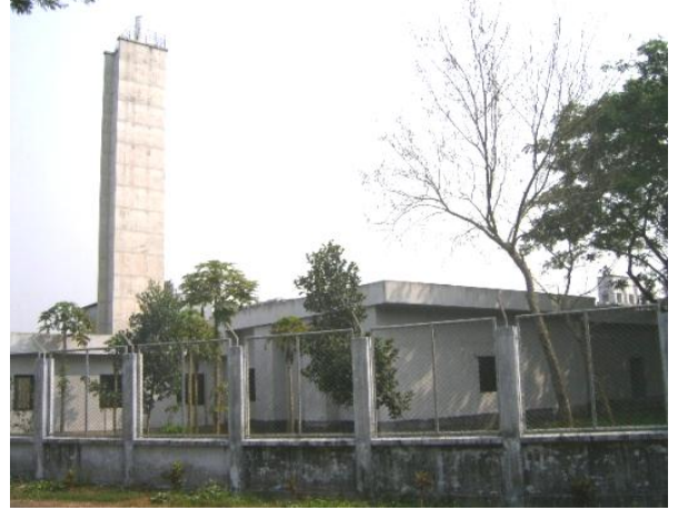
Health Physics and Waste Management Facility 19